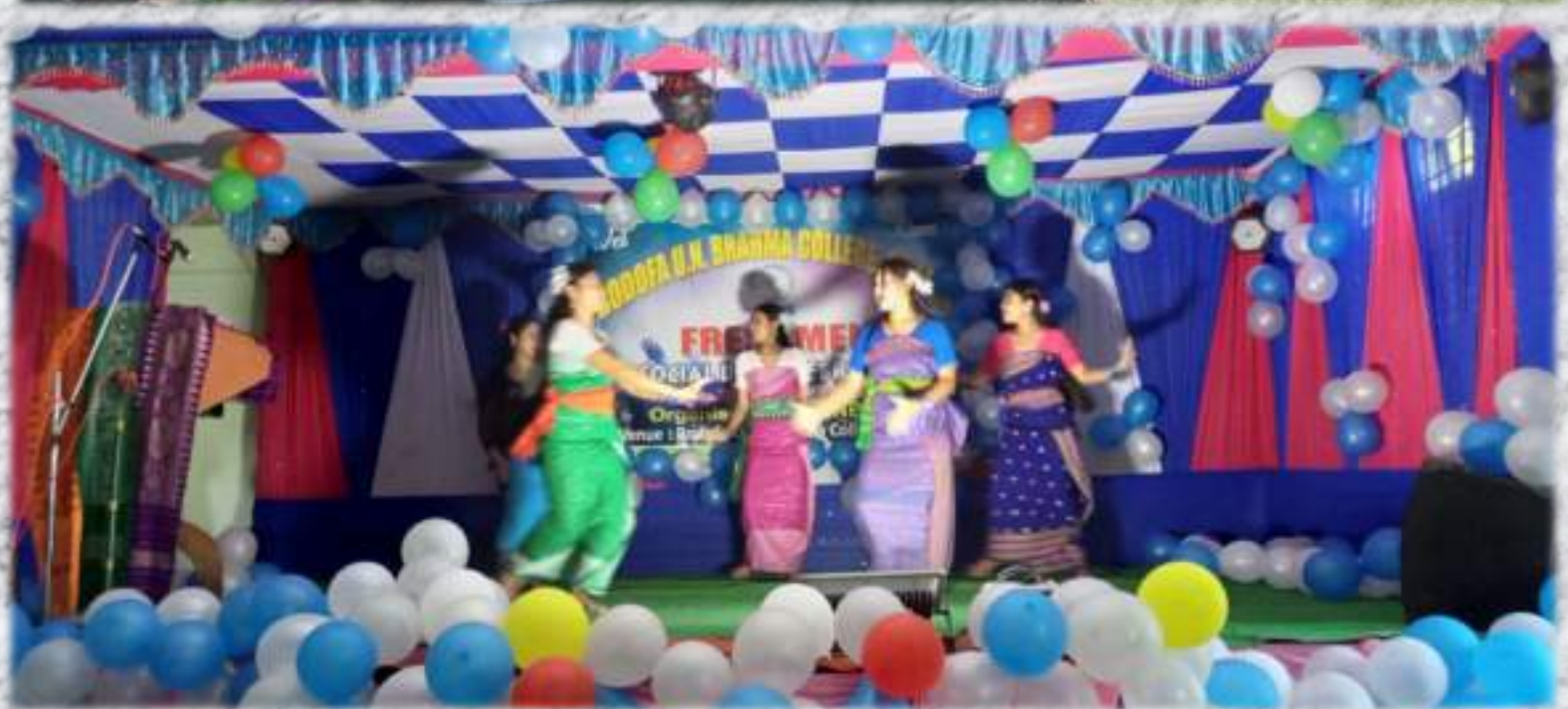
BODOFA U.N. BRAHMA COLLEGE, DOTMA KOKRAJHAR (BTR); ASSAM; PIN-783347 www.bodofaunbc.ac.in